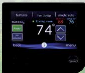
Infinity® System Control

* Full Infinity® System with the Infinity System Wall Control with Wi-Fi® capability. Remote access requires Wi-Fi model wall control and Apple™ or Android™ mobile device. Energy Tracking requires compatible equipment. Wi-Fi® is a registered trademark of Wi-Fi Alliance Corporation.