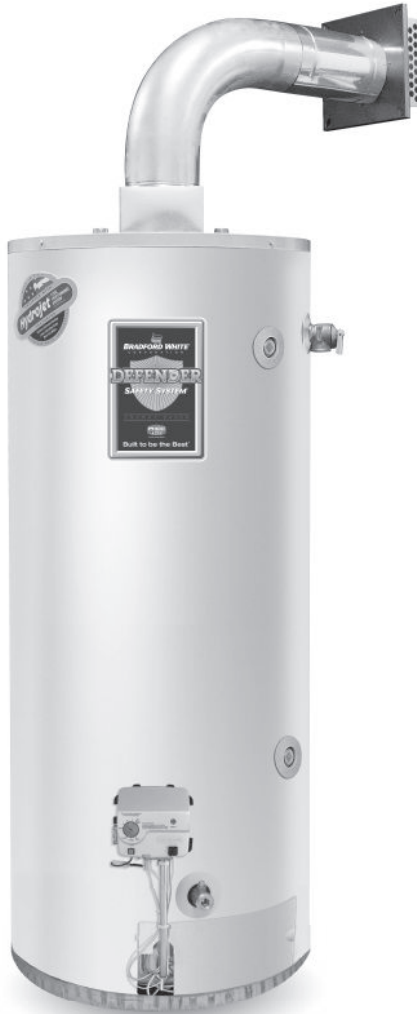
Photo is of RG2DV50H6N